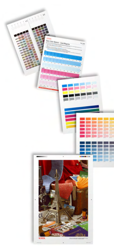
Built in color calibration tools give you the final output you want.

High-quality, consistent color is crucial when you rely on stunning visuals to convey your ideas and concepts. That's why the Xerox Phaser 7760 color printer is the designer's choice. It offers brilliant color, blazing speeds and easy-to-use features that make the most of everything you print.