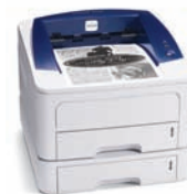
Phaser 3250 shown with optional Tray 2